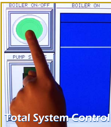
Total System Control

Flow Intelligence™: Only replace the energy you use