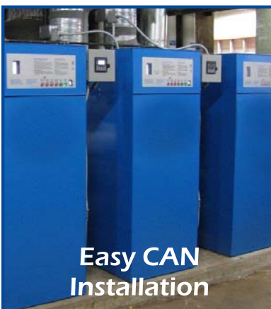
Easy CAN Installation

TPC-FI-FDP™ – Flexible platform with the strength of TPC